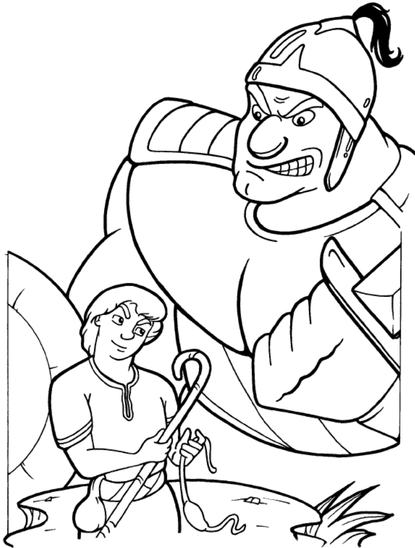
David & Goliath 1 Samuel 17:32-49