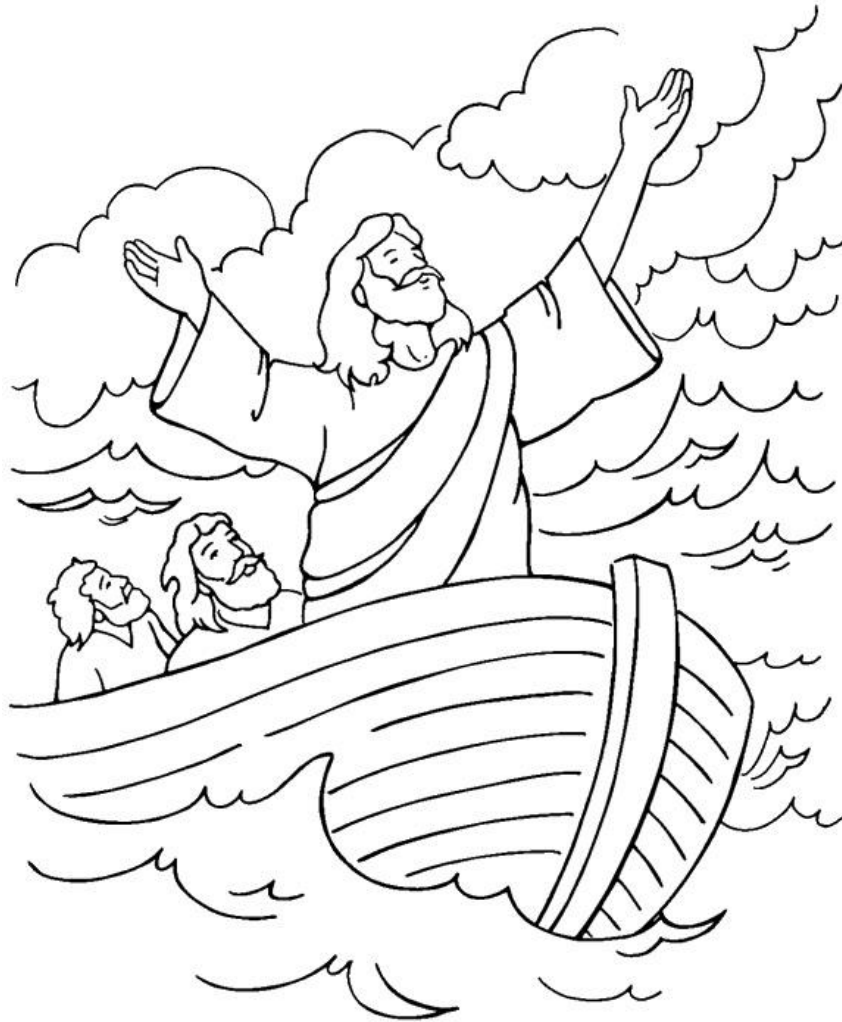
Jesus Calms the Storm

Unscramble each word and then place the numbered letters in the numbered boxes at the bottom to reveal the answer.