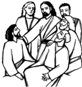
Calling the Twelve to him, he sent them out two by two. Mark 6:7 (NIV)