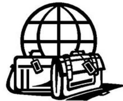
Take nothing for the journey except a staff. Mark 6:8