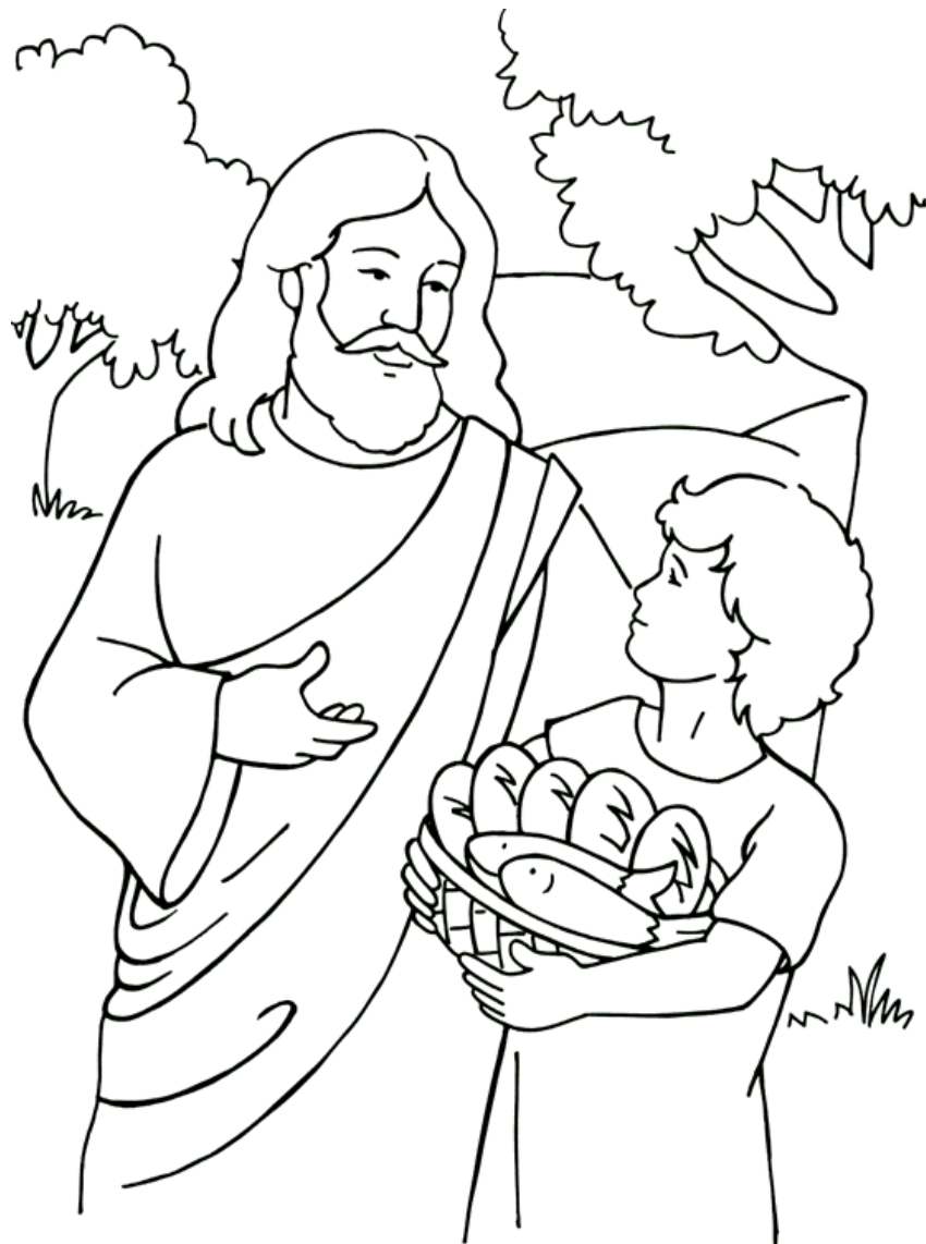
Jesus Feeds the 5000