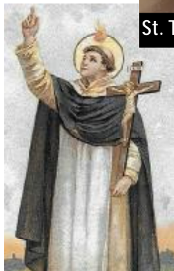
St. Vincent Ferrer

In the 12 th century, most who became Priests, Sisters or Brothers were expected to isolate themselves from the world and to live in monasteries or in established cloistered religious communities. This concept of Religious life did not sit well with Dominic. Like his friend and contemporary, Francis of Assisi, he was not convinced that this traditional and universally accepted lifestyle of service in the name of Christ, was the most effective way to inspire others to embrace the Christian Faith. Instead, he insisted that, though Priests and Professed Religious persons could still choose to live together in religious communities, they should still be allowed to