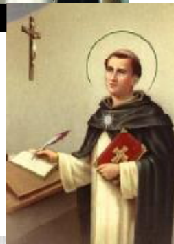
St. Thomas Aquinas

leave their convents and monasteries to minister and to live their Faith in the public domain among the people. In Assisi, Francis felt that he and his followers were best suited to do this by working among the poor. Dominic felt that he and his followers would be more effective by teaching the Gospel to students in universities and high schools. Although these may sound like good ideas to us today, both Dominic and Francis were branded as radicals in their day and many considered their proposals dangerous to the Faith. For this reason, both sought the approval of the Pope to pursue their dreams. Providentially, Pope Honorius III permitted Dominic to establish his "Order of Preachers" (Dominicans) in 1216 and Francis, his "Order of Friars Minor" (Franciscans) in 1223!