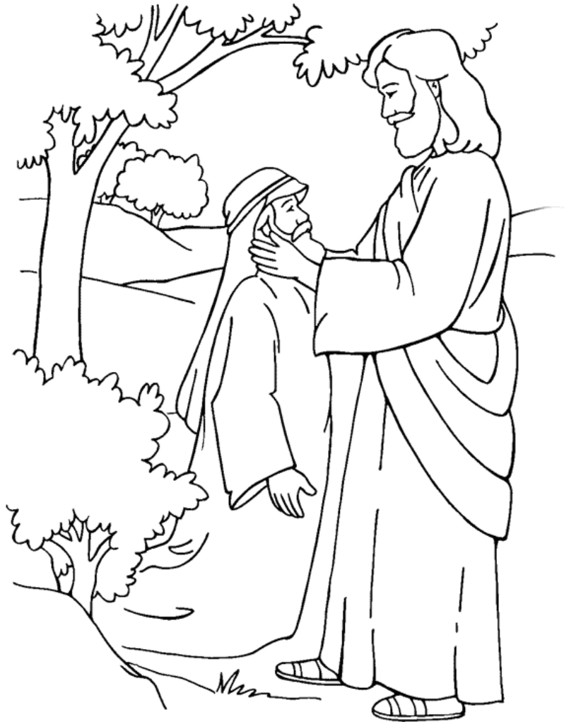
Jesus Heals a Deaf Man Mark 7:31-37

From Thru-the-Bible Coloring Pages © Standard Publishing. Used by permission. Reproducible Coloring Books may be purchased from Standard Publishing, www.standardpub.com , 1-800-323-5473.