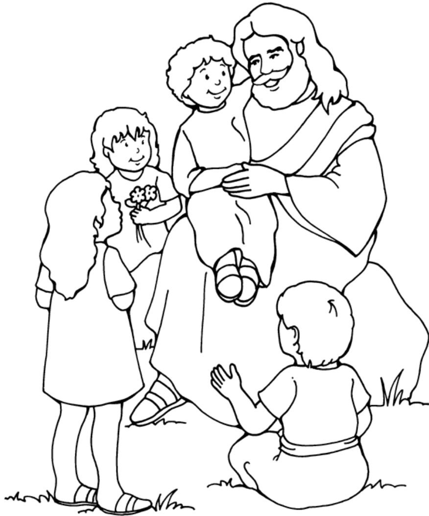
Jesus and the Children

From Thru-the-Bible Coloring Pages for Ages 4-8. © 1986,1988 Standard Publishing. Used by permission. Reproducible Coloring Books may be purchased from Standard Publishing, www.standardpub.com , 1-800-543-1301.