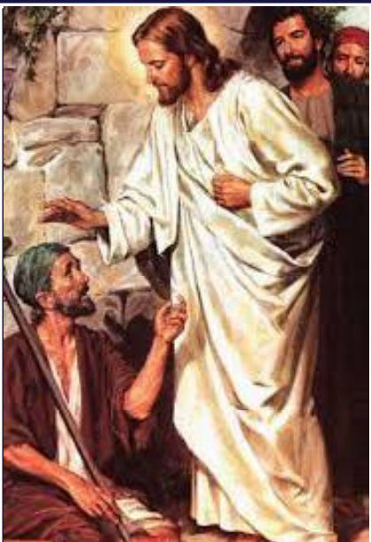
"BARTIMEUS RECEIVED HIS SIGHT AND FOLLOWED JESUS ON THE WAY". "