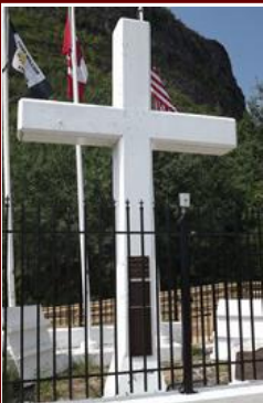
CENOTAPH ON MOUNT MCKAY

CANDLELIGHT SERVICE: 2024 On Sunday, December 8 th our annual Candlelight Prayer Service will take place at 7:00 pm in Our Lady's Chapel. All are welcome to attend!