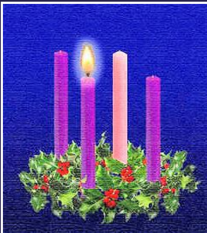
THE FIRST CANDLE IS CALLED 'THE CANDLE OF HOPE'