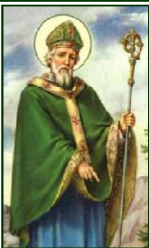
PATRON OF OUR CATHEDRAL