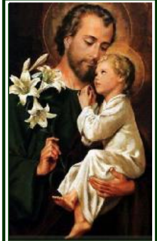
THE PATRON OF CANADA